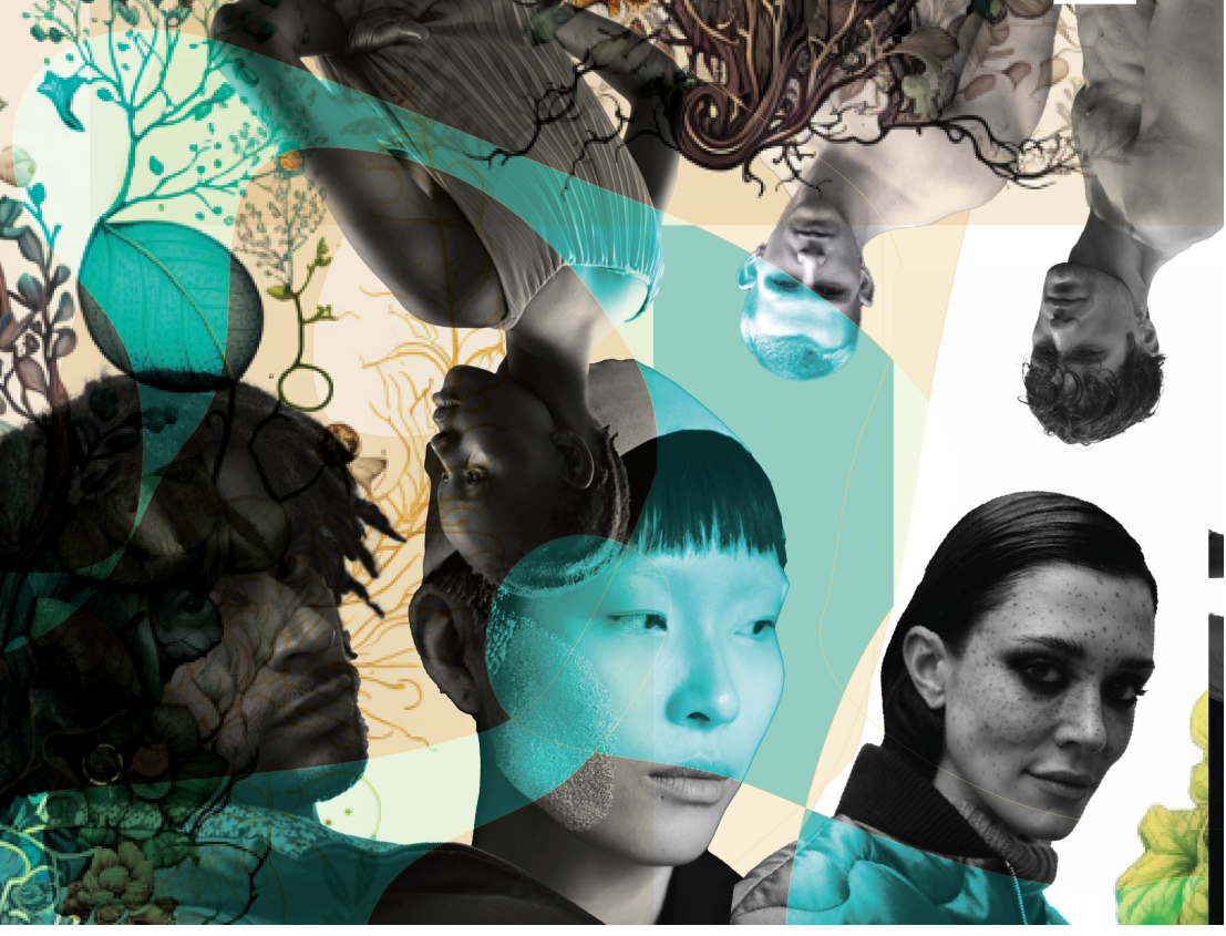
Table art by MA+KE lab -Endless Ocean photography series A river has no boundaries

The table designs pay homage to the vision of a true photo-conceptual artist, László Moholy Nagy, by using different mediums, such as mixing photography, light and materials in a way that elevates applied art to fine art in a contemporary way.